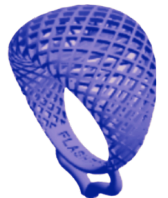
*Take the ring model as an example 25*18.8*33.6mm